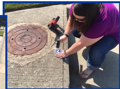
Tapping in a nail anchor