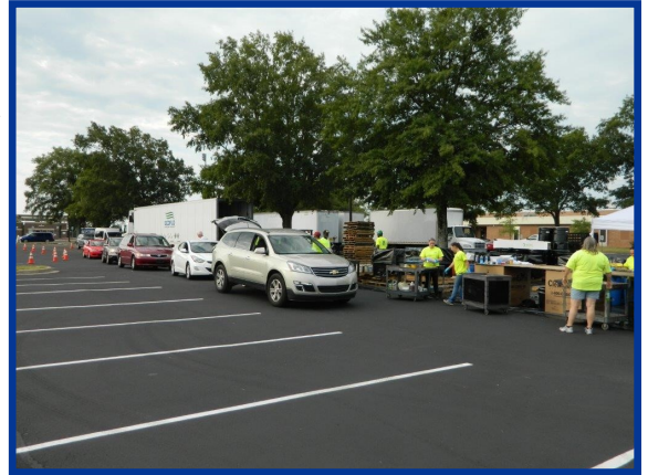
Household Hazardous Waste Drop-Off

recycled; 16.4 tons (33,883 lbs.) of household hazardous waste was collected for safe disposal; and 1.22 tons (2,440 lbs.) of items for Goodwill were donated. In addition, recycling saves space in landfills and allows recyclable materials to be reconstructed into useful products or reused in their current form. Getting rid of household hazardous waste safely at these events removes toxic chemicals from the environment that can easily pollute both land and water. If you missed this event, check out the date and time for the next event below.