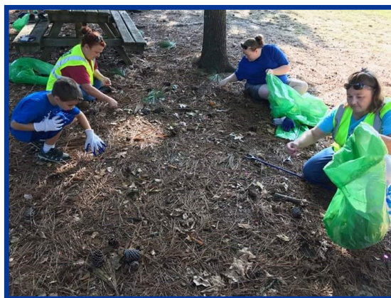
Shoreline volunteers collected trash