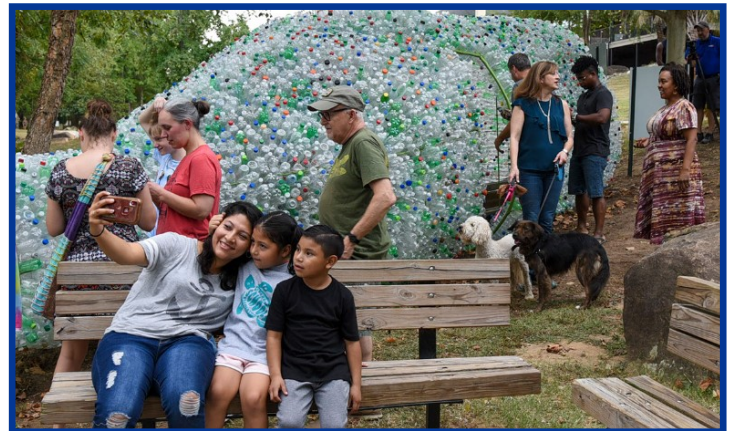
Visitors Experiencing the Sculpture