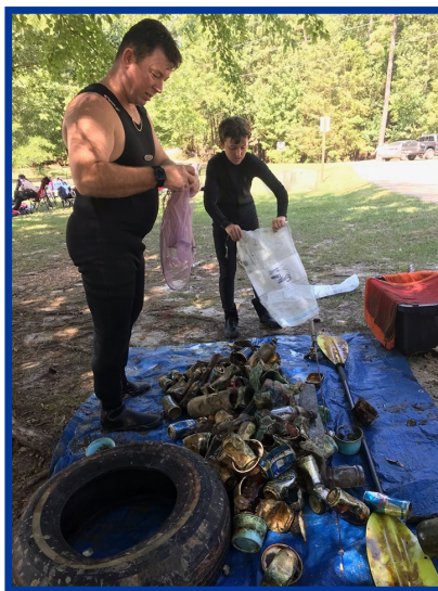
Divers collected under water trash