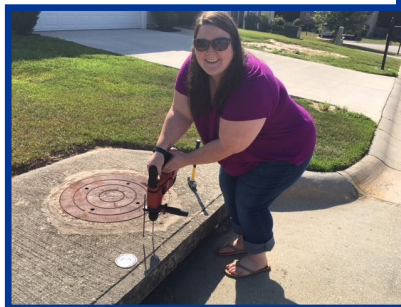
Using a hammer drill