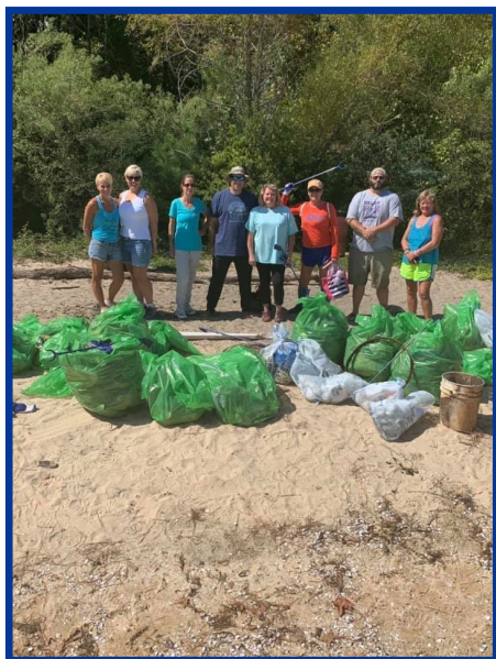
Volunteers collected trash

The U.S. Coast Guard Auxiliary, Lake Murray Flotilla, conducted a Splash Against Trash clean-up on September 21st in conjunction with Palmetto Pride. Three teams were positioned at Lake Murray Marina, Dreher Island and South Shore Marina assisting with volunteer check in and providing pollution awareness information to the public. Trash the Poop dog waste bag dispensers were given out at each location to dog owners who were pleased to receive them! At Dreher Island, 50 volunteers, of which 38 were divers from the Wateree Dive Center, collected 167 pounds of trash from the waters. The Shoreline and Island clean ups resulted in 1,500 pounds of bagged trash, two BBQ grills and 4 large buckets.