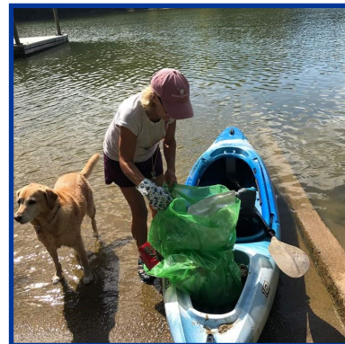
Boaters collected trash