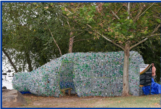
3 Seconds & Counting Sculpture

Creativity and conservation can be partners when it comes to respecting the environment by reducing plastic pollution. The City of West Columbia unveiled a unique sculpture entitled 3 Seconds and Counting on Friday, September 27th at the West Columbia River Walk Amphitheater. While we don't like to see plastic bottles littering the landscape, this sculpture, made entirely from plastic bottles was appealing in every way: It literally drew people in; It reused plastic bottles and it beautified rather than spoiled the environment near the river. The Lexington Countywide Stormwater Consortium and Lexington County Solid Waste Management contributed bottles toward this project thus reducing the cost for the County to recycle them. Many individuals also brought their plastic bottles to the City to include in the sculpture.