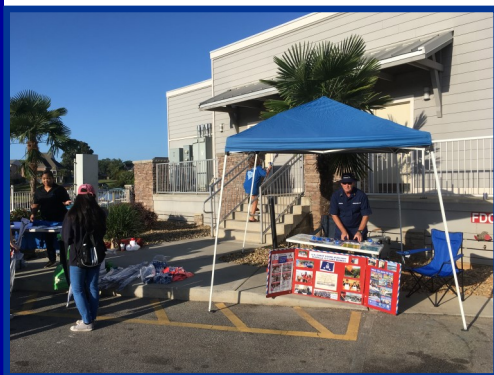
Coast Guard Auxiliary Display

The U.S. Coast Guard Auxiliary, Lake Murray Flotilla, conducted a Splash Against Trash clean-up on September 21st in conjunction with Palmetto Pride. Three teams were positioned at Lake Murray Marina, Dreher Island and South Shore Marina assisting with volunteer check in and providing pollution awareness information to the public. Trash the Poop dog waste bag dispensers were given out at each location to dog owners who were pleased to receive them! At Dreher Island, 50 volunteers, of which 38 were divers from the Wateree Dive Center, collected 167 pounds of trash from the waters. The Shoreline and Island clean ups resulted in 1,500 pounds of bagged trash, two BBQ grills and 4 large buckets.